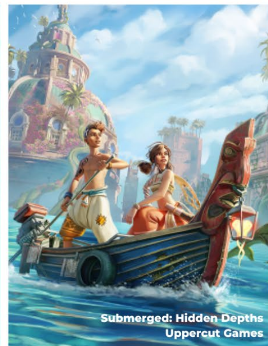
Submerged: Hidden Depths Uppercut Games