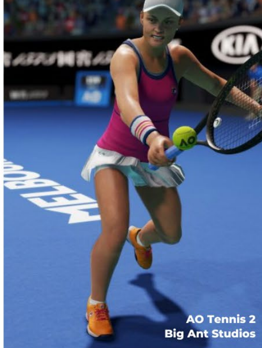
AO Tennis 2 Big Ant Studios