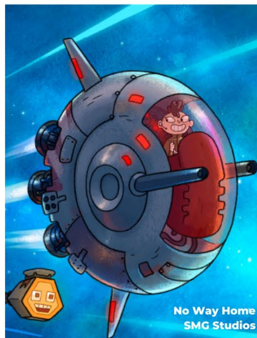
No Way Home SMG Studios