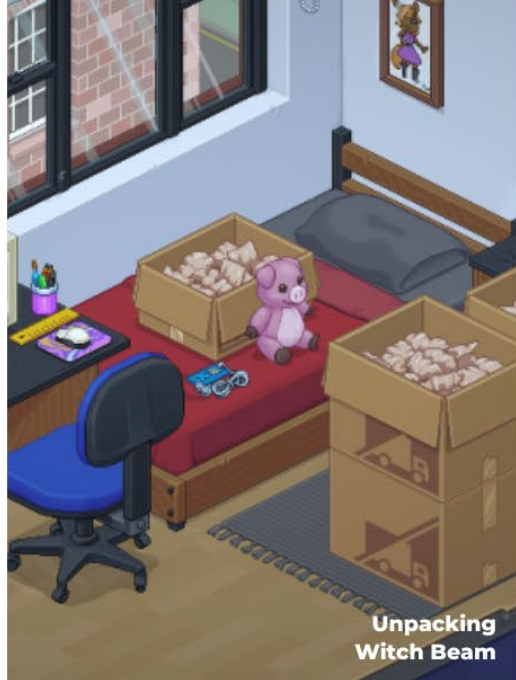
Unpacking Witch Beam